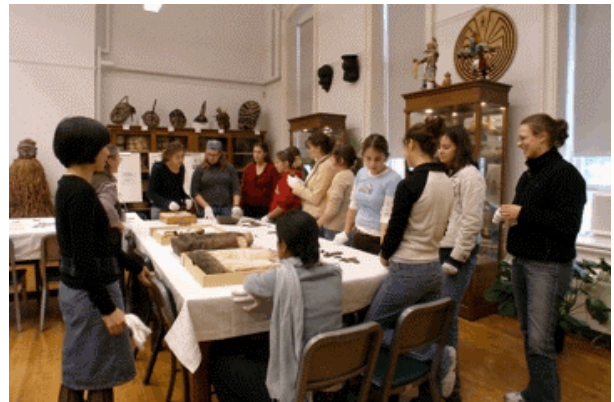
A class working with Inuit artifacts in the Anthropology Collections